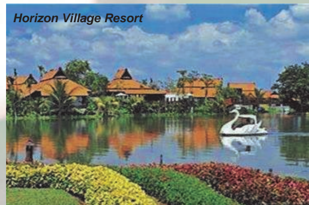
Horizon Village Resort

Adult and teens 13 and up: $620 double occupancy $820 single occupancy Children ages 4 to 12: $320 Infants/children under 4: Free